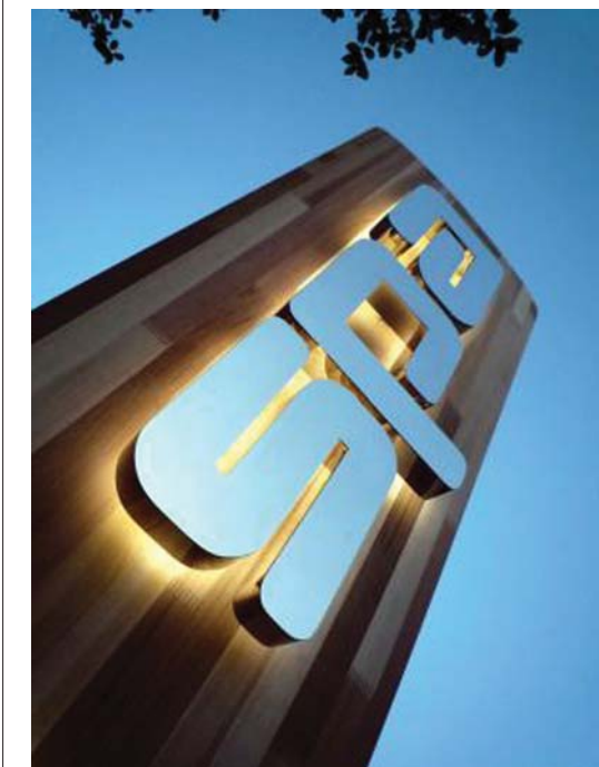
Sustainable sign system using wood offcuts, Signbox, 2011