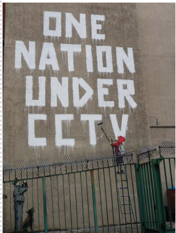
Graffiti Street Art Banksy, London, 2008.

For copyright reasons this image cannot be reproduced in the online version of this document.