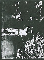
A FURTHER VIEW OF WESLEY D. JORDAN